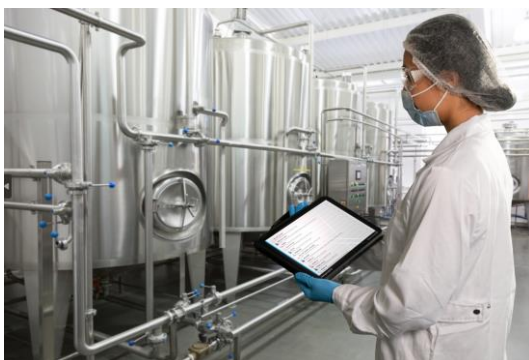
EH_Single Pair Ethernet_2.jpg

Thanks to the exceptional data connection that Ethernet technology offers, large volumes of data are processed quickly at field level.