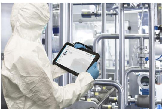
EH_Single Pair Ethernet_3.jpg

Single Pair Ethernet allows a bandwidth and speed that lifts field data transmission to a completely new level. Maintenance and plant managers benefit from new insights.