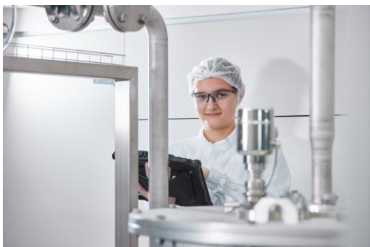
EH_Single Pair Ethernet_1.jpg

Thanks to the exceptional data connection that Ethernet technology offers, large volumes of data are processed quickly at field level.